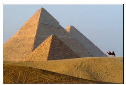
Pyramids of Giza, Egypt

The Giza Pyramids, built to endure an eternity, have done just that. The monumental tombs are relics of Egypt's Old Kingdom era and were constructed some 4,500 years ago.